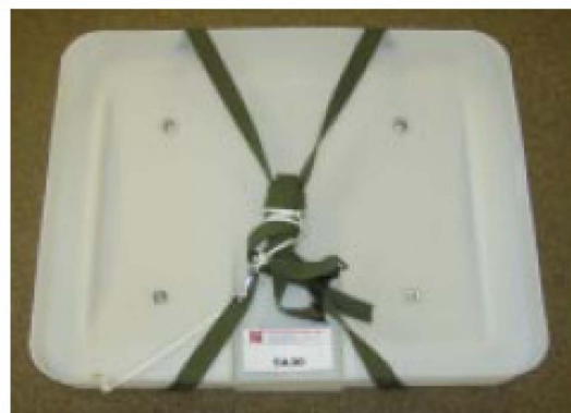
MODEL #: 5A30